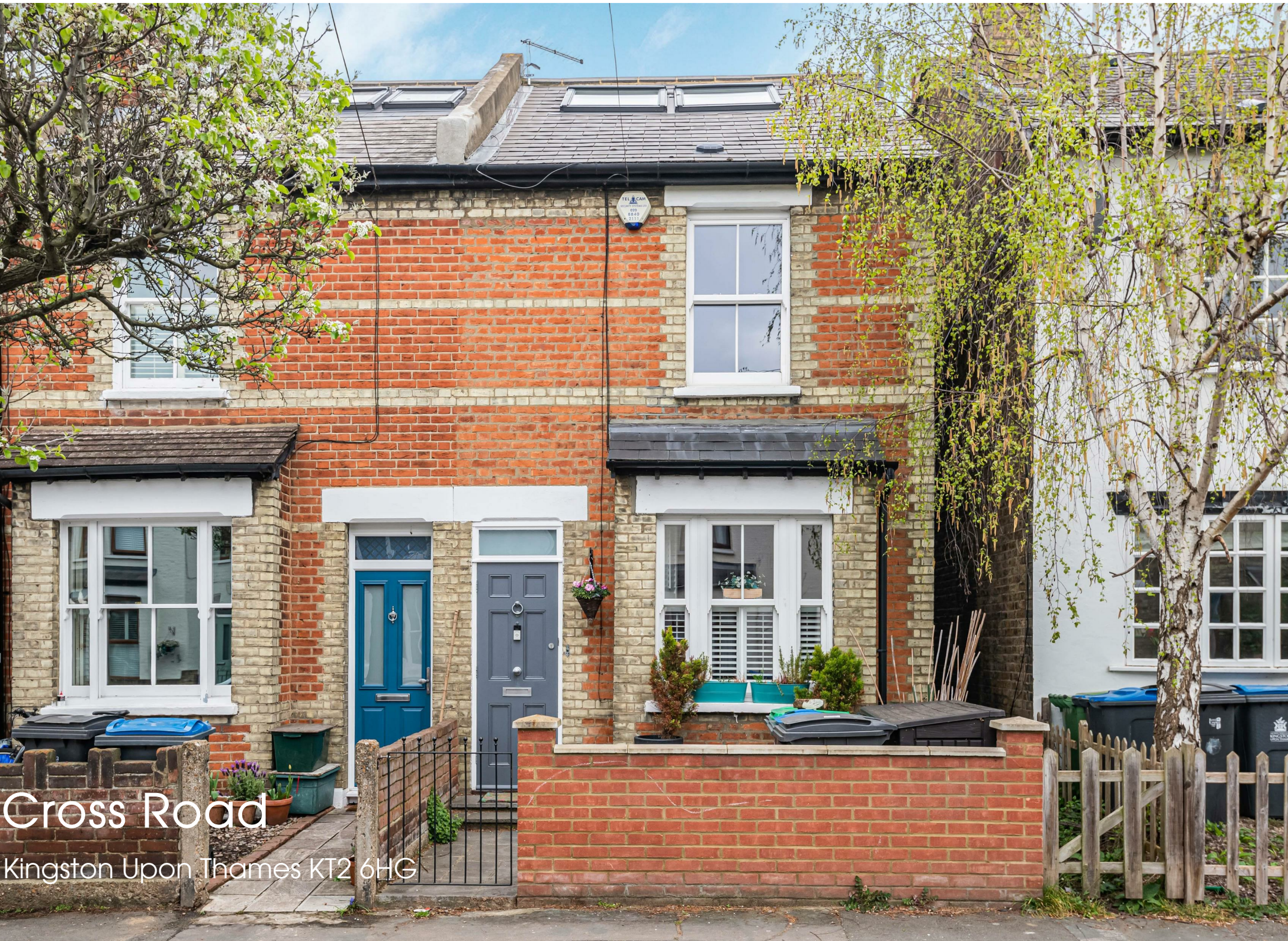
Cross Road Kingston Upon Thames KT2 6HG

Approximate Gross Internal Area 1307 sq ft - 122 sq m Ground Floor Area 576 sq ft - 54 sq m First Floor Area 412 sq ft - 38 sq m Top Floor Area 319 sq ft - 30 sq m